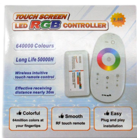
Color Box Packing